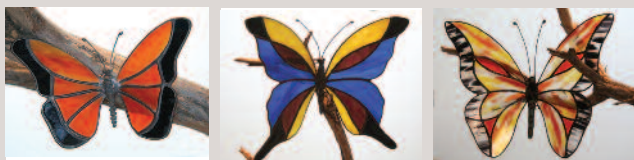
Donor-recognition stained glass butterflies on display in the Gift Shop.

Donors will receive a handcrafted, custom-engraved, unique glass butterfly that will be displayed prominently in the "Tree of Friends" in the Butterfly Pavilion courtyard. The size and placement of your butterfly will be commensurate with your donation. To become a "Friend", please visit www.thegarden.org , or contact Lorraine Frigolet at lorraine@thegarden.org .